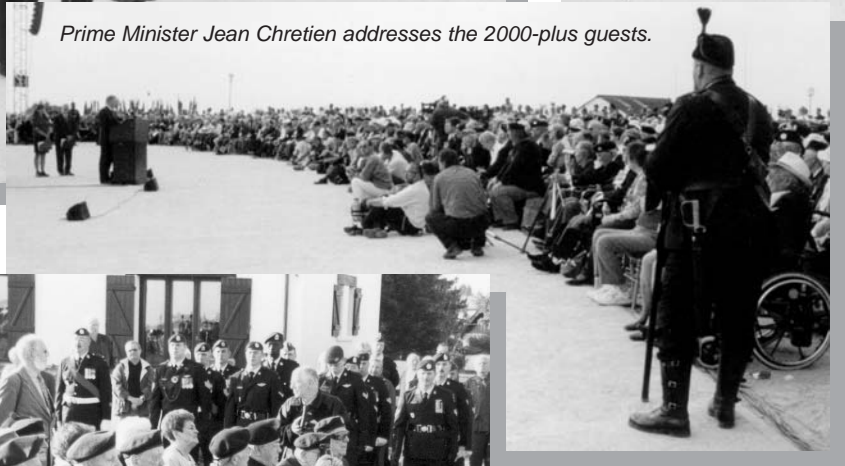
Prime Minister Jean Chretien addresses the 2000-plus guests.