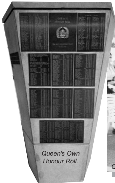
Queen's Own Honour Roll.