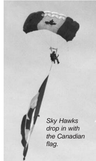
Sky Hawks drop in with the Canadian flag.