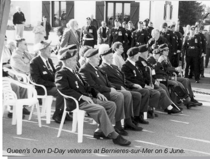
Queen's Own D-Day veterans at Bernieres-sur-Mer on 6 June.